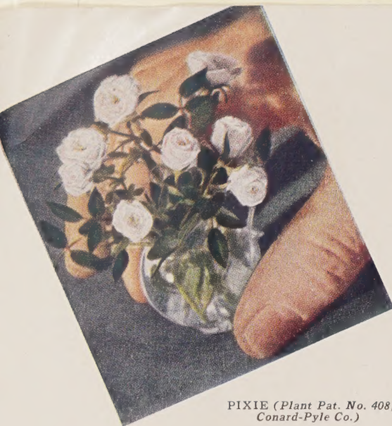
PIXIE (Plant Pat. No. 408, Conard-Pyle Co.)

TOM THUMB (Pl. Pat. 169). Deep crimson buds opening slightly lighter with a center touched with white. Plants are tiny, but flower with great brilliance. Each 75c; 3 for $2.00